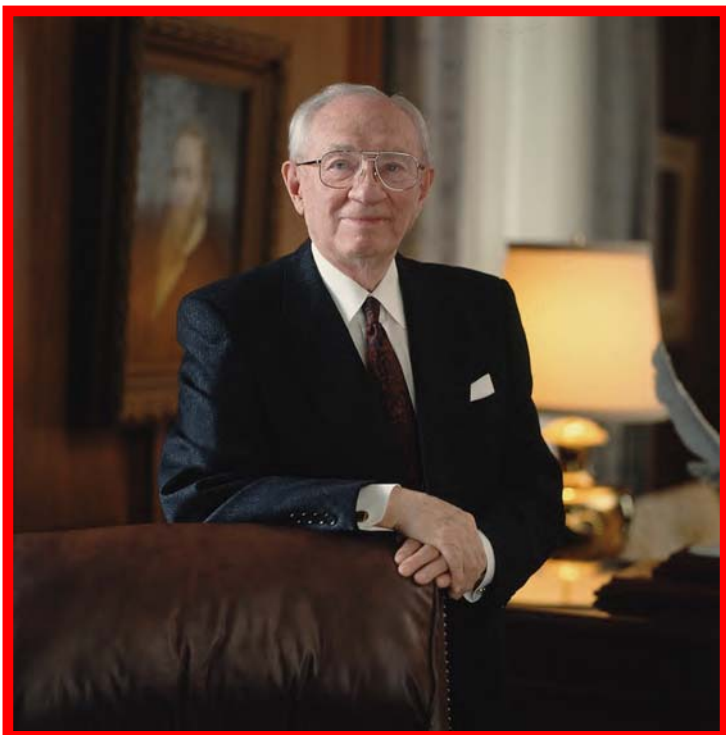
President Gordon B. Hinckley

A Plague on the World- New Era . July 1990