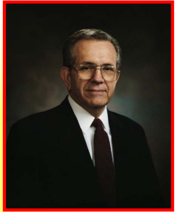
Elder Boyd K. Packer

"...But it is a synthetic, a wicked counterfeit, for they return to a depression worse than the one they left. Then they become players in the saddest of human tragedies. For as they turn again to this release they are not seeking what they sought before, but indulge to escape the consequences of each previous adventure with drugs. This is addiction! This is slavery!"