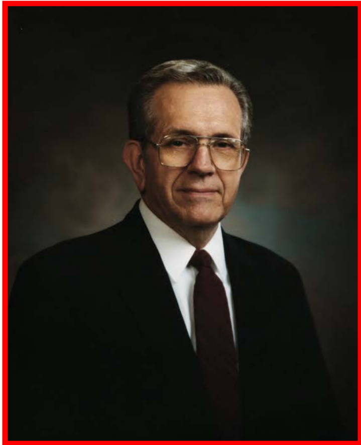
Elder Boyd K. Packer