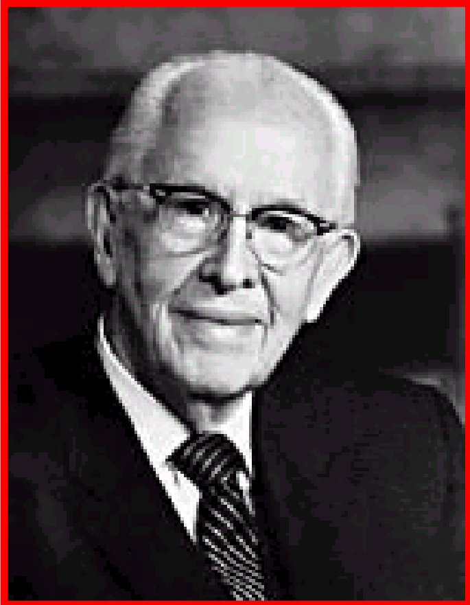
Pres. Ezra Taft Benson

Conference Reports, Sunday Morning- April 1983